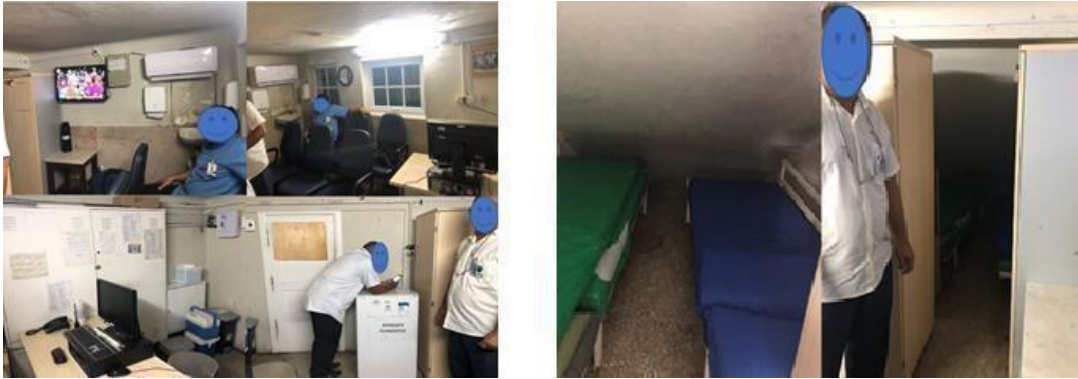
Figure 2. Stretcher bearer sector room and resting place for stretcher bearers.

Another frequently cited suggestion was the improvement of the sector room, which, as can be seen in Figure 2, is a small environment, with low ceilings for the anthropometry of the occupants, with infiltrations in one of the walls, as well as in the resting place, seen in Figure 2, which is under a staircase, whose ceiling is inclined and very low, in addition to the place being extremely small, in view of this, it has been reported that there have been accidents of head hitting the ceiling when getting up from the mattress, or the door because she is shorter than the height of most of them.