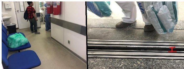
Figure 4. Access to Maternity Unit A and elevator elevation. (Authors, 2019)

Based on the reports and observations, the following pre-diagnoses were reached: