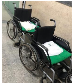
Figure 3. Wheelchairs in the sector. (Authors, 2019)

Furthermore, with open observations it was found that equipment is only cleaned when it is visibly dirty (with stains), and the cloth on the wheelchair is also only changed when it is very dirty with dark stains or when there is blood from the patient. , the condition of the wheelchairs was also observed, which are rusty, dirty and have broken footrests, and none of them have support for IVs or other medicines, as shown in Figure 3.