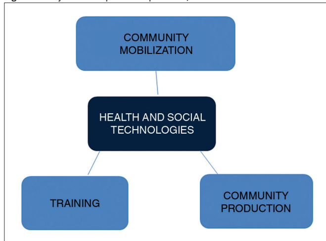
Figure 2. Project development steps. Brazil, 2016.

In 2005, with CNPq support through the MCT/MMA/SEAP/ SEPPIR/CNPq Edict Number 26/2005, we developed in these three communities the project entitled "Promoting Citizens: Homemade Candy Cooperative", where we sought to implement the candy cooperative using the typical fruits of the region, in order to meet the needs of the population. Therefore, from the local voluntary labor, two experimental kitchens were built in Praia Grande and Moreré, where they produced banana candy on straw (a specialty of Praia Grande confectioners) and cocada with cashew compote (a Moreré specialty).