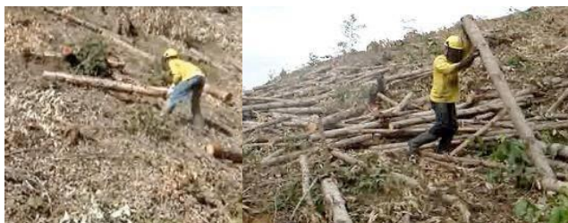
Figure 1: a) Manual tipping

Workers are divided into teams, each with a responsible supervisor. Remuneration is made through a fixed salary plus variable remuneration, which is associated with individual production. It was observed that the established production target was not met by the majority of Tombo and Empilhamento workers, which was proven through the analysis of production data over the course of a year, indicating that this target was overestimated. The activity of manually tipping and stacking wood required great physical effort on the part of the worker, especially on the trunk and upper limbs, when manipulating and moving the wooden logs (size 2.60m and weight varying between 25 and 100kg each). The activity consisted of throwing wooden logs “down the hill” to the side of the roads, where they will later be stacked on a platform made with local wood, called a “pillow”. To move the logs, the worker uses his own hands or an axe, commonly called a “hatchet” (Figure 1).