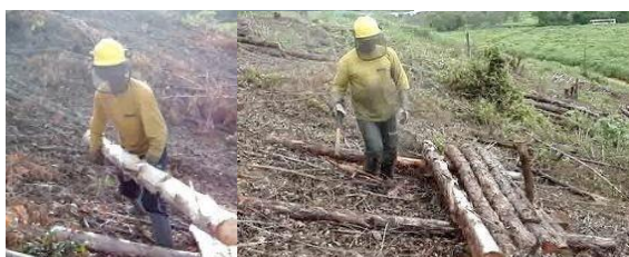
Figure 1: b) Manual Stacking