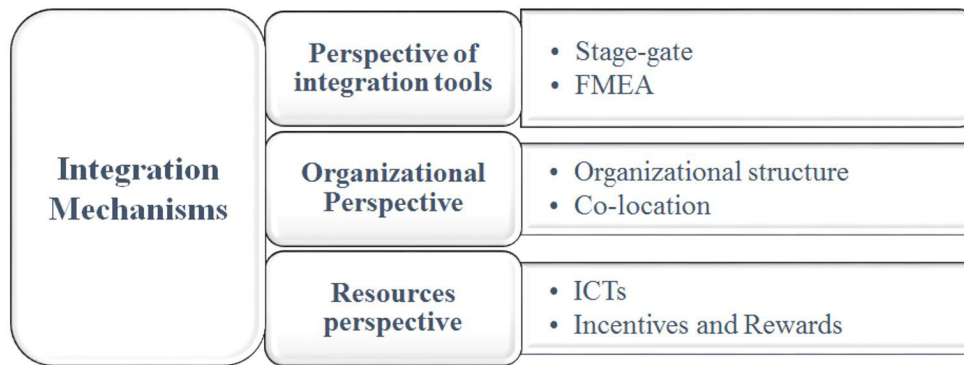
Figure 1. Mechanisms for integration in relation to organizational perspectives, resources and tools.