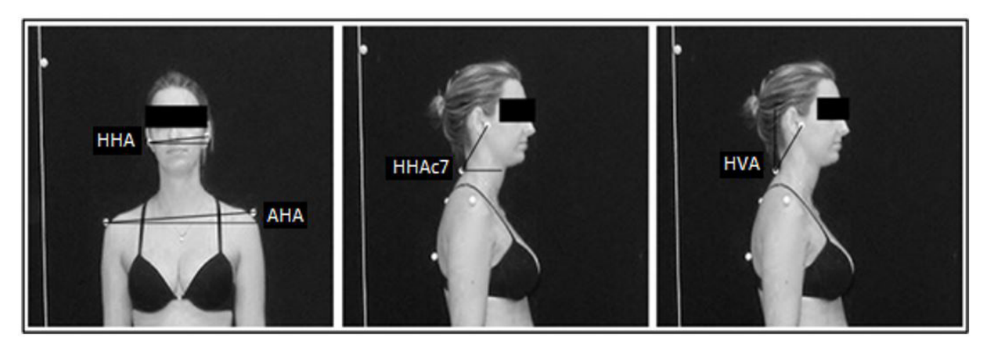
Figure 2. Anatomic points marked for evaluation of the angles: Acromion Horizontal Alignment (AHA); Head Vertical Alignment (HVA); Head Horizontal Alignment (HHA); Head Horizontal Alignment C7 (HHAc7)

Table 1 shows the median and quartiles of normalized RMS values regarding the electromyographic activity of the masseter, anterior temporal, sternocleidomastoid and upper