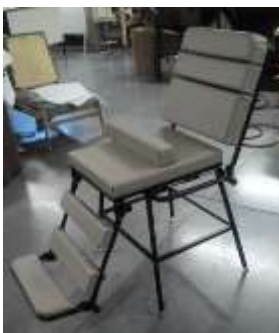
Figure 1: Prototype of the experimental wheelchair

For the experiment, an experimental wheelchair was fabricated, which presented variation in the tilt of the backrest and footrest at angles of 90°, 100°, 110°, and 120°, with the seat parallel to the ground. The prototype was manufactured by the company Herval, from Dois Irmãos (RS), which is a partner of the research macro-project. The experimental wheelchair is illustrated in Figure 1.