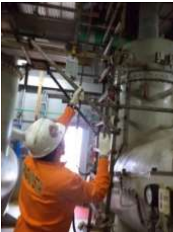
Figure 6. Chain-operated valve

Another alternative is the use of valves operated with the aid of chains, as shown in Figure 6. This type of valve is widely used in industrial areas with limited space for accessory installation.