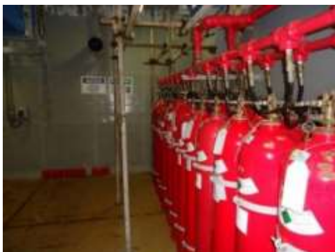
Figure 7. CO 2 battery room

Regarding ergonomic design, we can mention the changes that occurred in the design phase of the studied platform, when another maritime unit was used as a reference situation. On this occasion, the improvement in the elevation of valves and pipelines on the main deck by approximately 400 millimeters is highlighted, along with the installation of deluge valves (Automatic Deluge Valve - ADV) along the edges on both port and starboard sides. This change provided greater safety for workers moving through the area. On the other hand, other points of improvement were not anticipated in the project, such as the ease of access to the CO 2 battery room, which is arranged in two rows facing each other, creating difficulties for replacing and maintaining the 45 kg cylinders. As a result, during their movement, there is an increased risk of accidental CO 2 discharge in a particular environment or accidents involving limb presses.