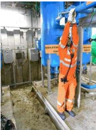
Figure 2. Valve Location in Relation to the Skid

In the analyzed events, we can observe that when the project is conceived with flaws, the worker devises alternatives for task execution. The listed events are some demonstrations with undesired consequences of known problems. In Figures 3 and 4, there are examples of other operation points in locations with difficult access. Given this scenario, the safety professional must have a decisive role in every workplace where there are no appropriate access means, whether by recommending the installation of chain mechanisms in valves,