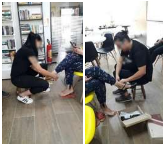
Figures 3 and 4 - Integration of the stool into work practice.

In Figure 1, it is noticeable that the saleswoman places all her body weight on her feet and does not maintain the spine properly aligned. In Figure 2, the saleswoman demonstrates an incorrect way to squat, flexing the trunk in an incorrect manner and overloading the spine.