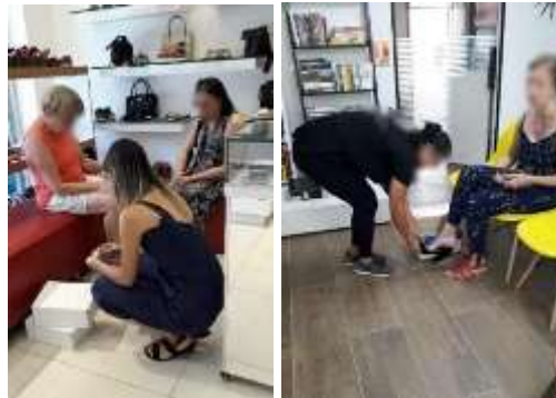
Figures 1 and 2 - Inadequate Posture