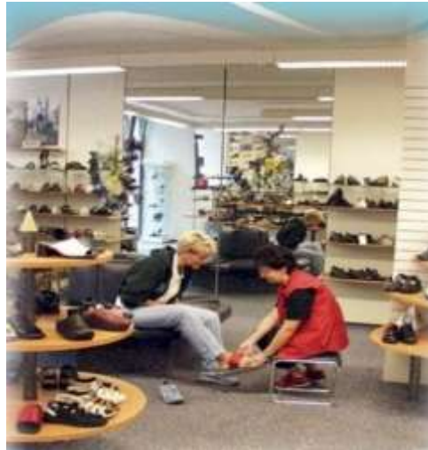
Figure 5 - Proper posture with the assistance of a stool.