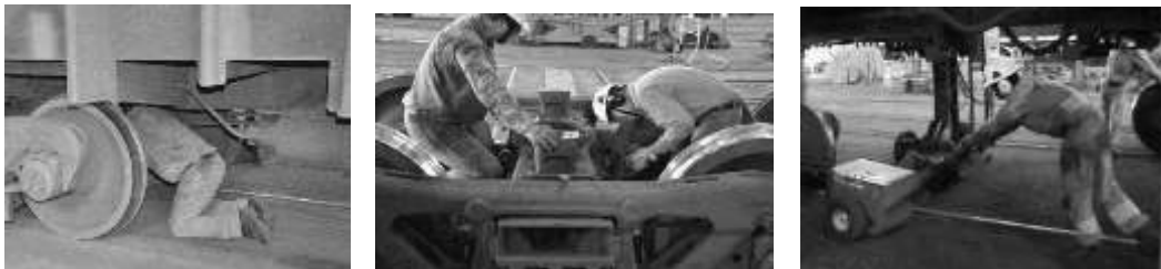
Figure 1: Examples of Inappropriate Postures

Employees assume various postures during the operation, some of which require physical effort (Figure 1), such as: moving and removing parts of the railcar; using tools, moving parts, and equipment during the operation (for part removal, moving levers). And to turn the crank located beside the railcar, occasionally, the use of pieces arranged in the workplace is necessary to assist in freeing the part. This task requires physical effort from the employees.