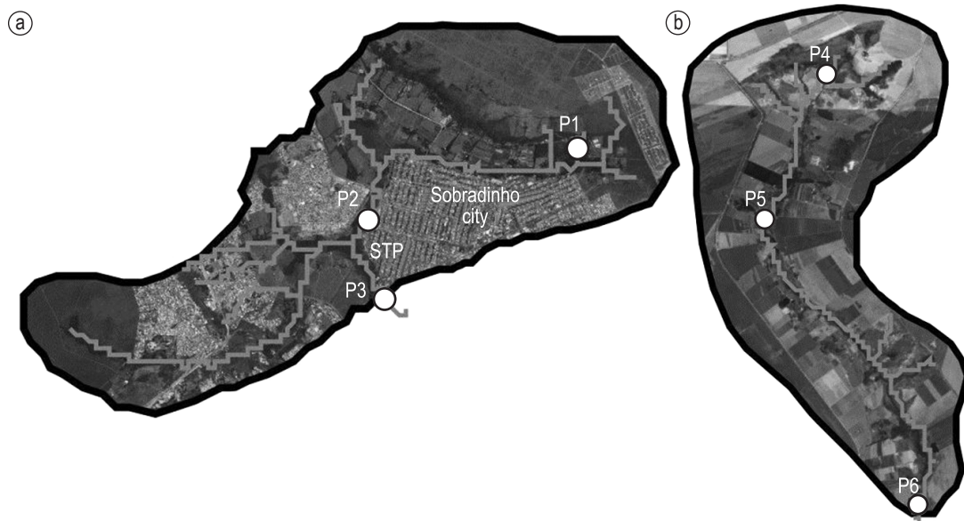
Figure 2. Land use and water sampling points in the Sobradinho river basin, showing urban land use (a) and in the Jardim river basin, showing agricultural land use (b).