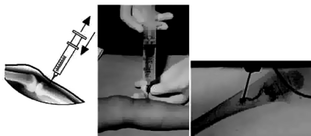
Figure 1 – The Intraosseous Technique and Infusion of Anesthetic Agents.

All results were reported as mean \pm standard deviation. After inspecting for normality and homogeneity of variance among groups, differences between groups were calculated using the unpaired Student's t test. Analysis included Wilcoxon's test when appropriate. Statistical analysis was performed using PadGraph Prism software (GraphPad Software Inc., San Diego, CA, U.S.A.).