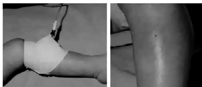
Figure 2 – Connecting the Infusion Pump.

Left, middle: The intraosseous technique for infusion of anesthetic agents. Right: radioscropy after injecting contrast (Hexabrix®) confirmed the needle's position.