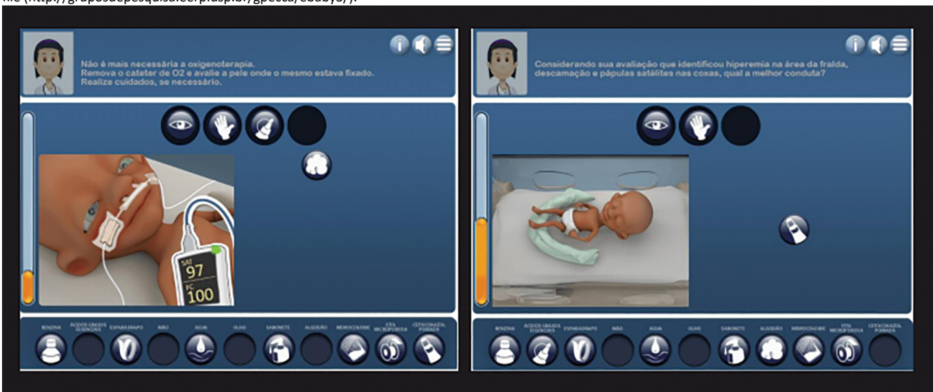
Figure 3. Screens of the serious game e-Baby: skin integrity demonstrating the available and selected toolbars, and the drag-and-drop process.