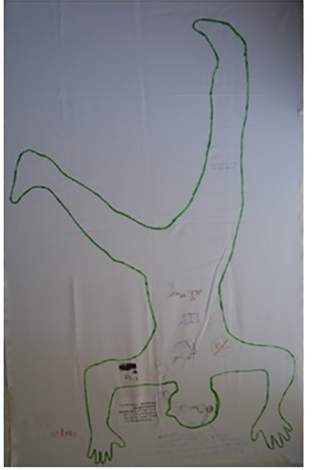
(b) Participant 2

Thus, the representation of the "I" begins and its relations with aspects related to daily life and as a practitioner of capoeira or dance. The choice of this initial position indicates who these participants are and what their identity is in the context of the analyzed practice. This is linked to the gestural and postural habits that are naturally internalized by accumulation and repetition within the body practices.<sup>20</sup>