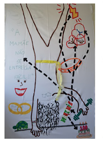
(a) Participant 5

Figure 2. Body map of the participants indicating the hand standing.