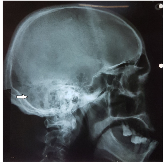
Figure 1. Lateral skull X-ray showing bony erosions (Arrow) suspicious for osteomyelitis.

showed an infrarenal AAA with an anterior-posterior diameter of 4.2cm. Adjacent to the aneurysm, there was a large retroperitoneal hematoma indicative of leaking. A non-contrast CT of the abdomen confirmed the USS findings. (Figure 2) Investigations available at the time revealed a WBC count of 13.26 \times 10^3 \mu\text{L} , Hb of 7.7g/dL, creatinine of 4.77mg/dL, C reactive protein level of 156mg/dL, and an ESR of 130mm in the first hour.