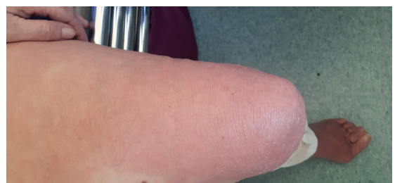
Figure 3. Eczema of the left thigh.