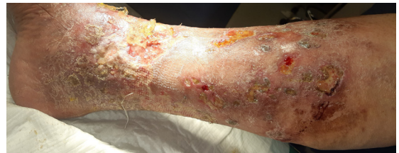
Figure 1. Numerous irregular infected ulcers of the right lower extremity.

Histopathological examination of the leg ulcers showed lymphoplasmacytic infiltration with a CD20, CD43