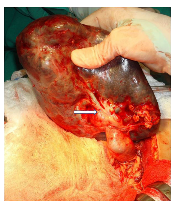
Figure 1. Surgical view of the wandering splenomegaly caused by splenic torsion. The spleen is only supplied by the left gastroomental vessels of the greater omentum connected to the inferior polar artery and vein (arrow). Observe the absence of perisplenic ligaments and the lack of the main splenic artery and vein as well as of the superior polar and splenogastric vessels. Note the splenic congestion and the highly dilated inferior polar and left gastroepiploic veins due to the previous splenic torsion.

The detectable arterial pulse was from the left gastro-omental artery to the splenic polar artery, characterizing reversed blood flow. The venous blood flow was also reversed from the inferior splenic polar vein to the left gastro-omental veins. The portal vein