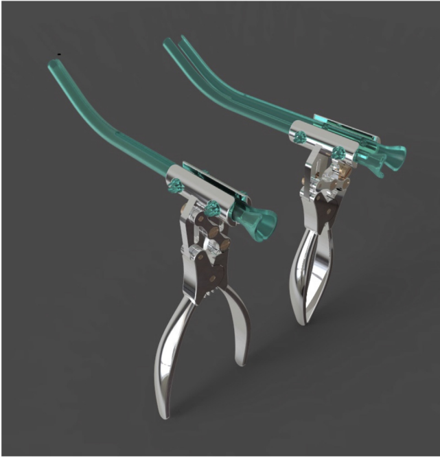
Figure 1 The profile of the forceps.