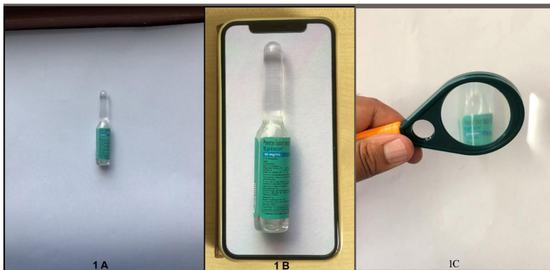
Figure 1 A, Image of ampoule taken while keeping at convenient distance; B, Zoomed mobile image of the same ampoule; C, Ampoule's label as visible through a magnifying glass.

Standard specifications exist for labels for small-volume (100 mL or less) parenteral drug containers. The standard provides recommendations for the color, size, design, general properties and typographical characteristics of the labels. It also states that the font size should be as large as possible to aid readers. A size of 9 points, as measured in 'Times New Roman', not narrowed, with a space between lines of at least 3 mm, is the minimum for the packet leaflet. User testing, meant to test the readability of a specimen