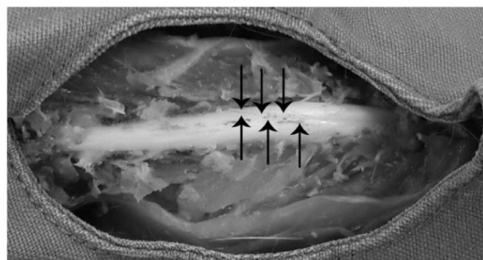
Figure 1 Spinal cord. Slender arrows indicate PU-10 catheter on the dorsal side of the lower part of the spinal cord.

A histopathological evaluation was made in 3 areas: neuronal damage (chromatolysis, gliosis, and neuritis); meningeal damage (inflammation, adhesion, and fibrosis);