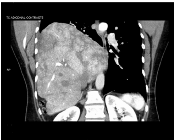
Figure 2 Diagnosis confirmed by axial CT: diaphragmatic hernia with almost complete herniation of the liver into the right hemithorax.