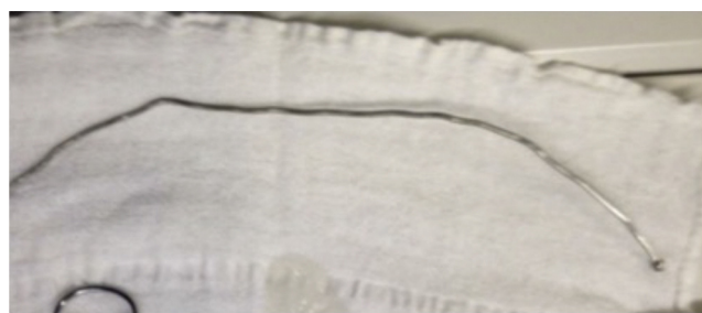
Figure 1 The guide wire used.

Intravenous infusion was made in left arm with Jelco 20G. After intravenous induction with fentanyl (250 mcg), lidocaine (20 mg), propofol (110 mg) and cisatracurium (7 mg), ventilation under face mask was started.