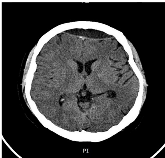
Figure 1 Preoperative CT scan.

Three weeks later, she presented again with wound breakdown and pus discharge from the craniotomy site. CT (Fig. 1) revealed a subdural empyema in both frontal regions measuring 1.3 cm in depth with post-surgical encephalomalacic changes in the left parasagittal region. She was posted for an emergency craniectomy and wound debridement.