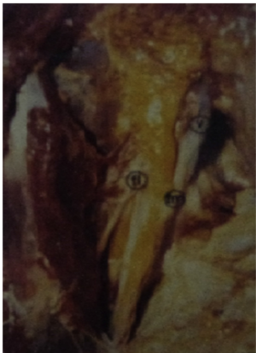
Figure 1 Total involvement of the brachial plexus (yellow). V, axillary vein; fl, lateral fasciculus; fm, medial fasciculus.