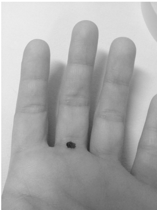
Figure 6 Location for hand finger block using only one local anesthetic injection into the subcutaneous space and applied approximately at the level of the midpoint of palmar interdigital crease.