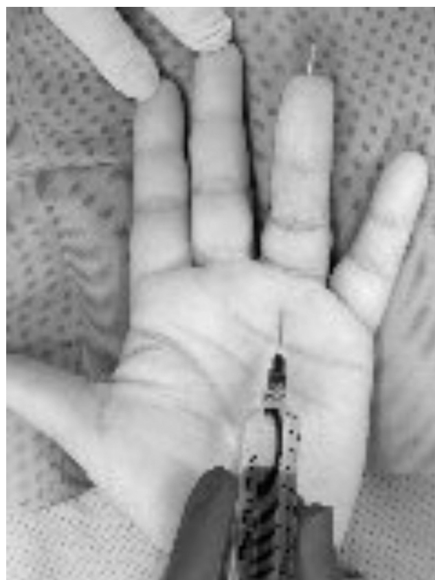
Figure 5 Transthecal blockade. The puncture for anesthetic solution administration is performed in the sheath of the finger flexor tendon (proximal level of the palmar digital crease or a little more distal).

Where several fingers are involved in the surgery, a good option is a blockade at the wrist level. 1