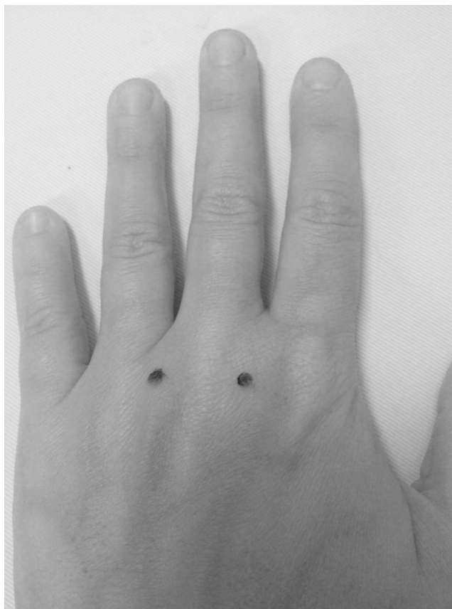
Figure 4 Transmetacarpal blockade with outstretched hand. The reference points were marked to facilitate the anesthetic solution application. Details in the text.

injection with epinephrine. The anesthesia lasted 48 min when epinephrine was not used and 280 min when the vasoconstrictor was used. With the highest concentration and dose of lidocaine (2% 5.4 mL) with epinephrine 1:100,000, anesthesia can last up to twice that time. 10