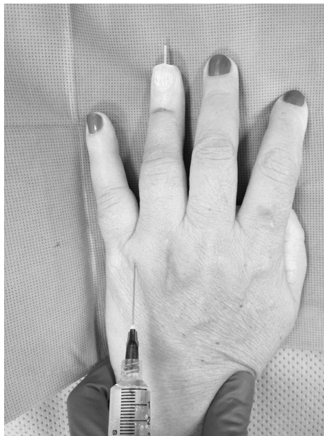
Figure 3 Blockade of ring finger by transmetacarpal route. Needle insertion is through the dorsal side of the hand, about 1 cm from metacarpophalangeal joint and halfway between two metacarpal bones. Details in the text.

The transthecal method was described in 1990 when the quick installation of anesthesia throughout the finger was seen after the application of a steroid and lidocaine mixture to the flexor tendon sheath for trigger finger treatment. 5