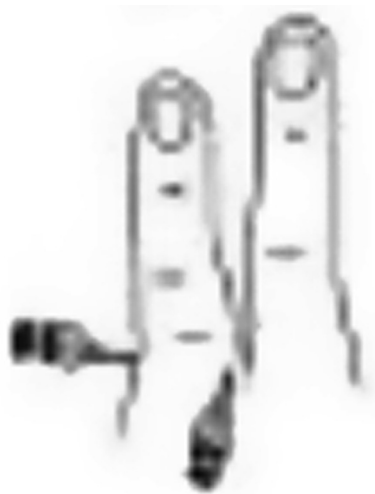
Figure 2 Subcutaneous blockade of the dorsal and palmar nerves of right index finger. Illustration: Gladys N. dos Reis.

with the same characteristics mentioned above; 1 mL of anesthetic solution is injected superficially to block the dorsal digital nerve and the needle is advanced to block the palmar digital nerve. This procedure must be repeated on the other side after the needle has been withdrawn to the skin and redirected to the opposite side of the finger back to superficially apply another 1 mL of anesthetic solution. 2 Care must always be exercised with the anesthetic solution volumes administered in order not to create a compression circumferential ring of neurovascular bundles.