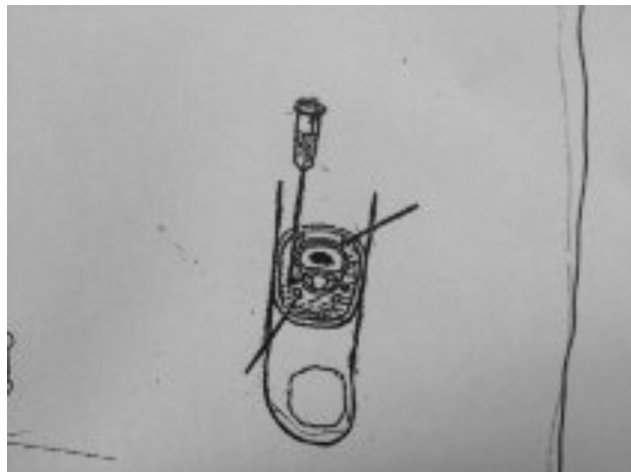
Figure 1 Cross section of the base of proximal phalanx of finger. Note the positioning of dorsal (right arrow) and ventral (left arrow) digital nerves and vessels. Also note the needle for these nerves blockade by dorsolateral route of finger base. Modified from Figures 10–17 (A) by Ref. 1.

First, one must know the contraindications for performing these anesthetic blockades. These are as follows: absolute, such as patient's refusal to undergo the procedure, peripheral vascular disease in the region, and infection next to the injection site. Relative, when it is absolutely necessary to test nerve function early in the postoperative period due to blockade establishment of sensory and motor conduction whenever this condition can mask the establishment of a postoperative compartment syndrome. And in a patient already with nerve damage or paresthesia, due to the always present possibility of causing nerve injury. 1-4 There