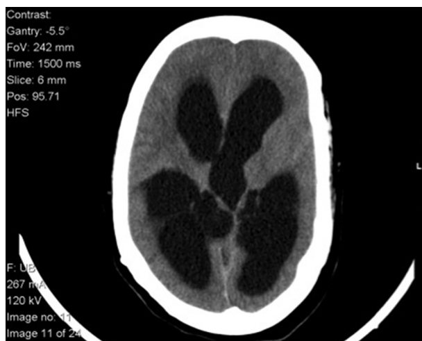
Figure 1 Admission CT scan showing triventricular hydrocephalus.

During pre-oxygenation, and with the supine position, the presence of pink foamy secretions was noticed.