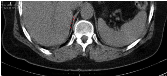
Figure 3 Intervertebral vein.