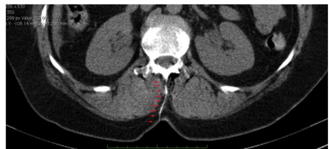
Figure 1 Catheter contrasted from the skin to the epidural space, marked by red arrows.

The catheter was removed uneventfully. The patient had a good clinical course and was discharged on the second postoperative day, with no complaints.