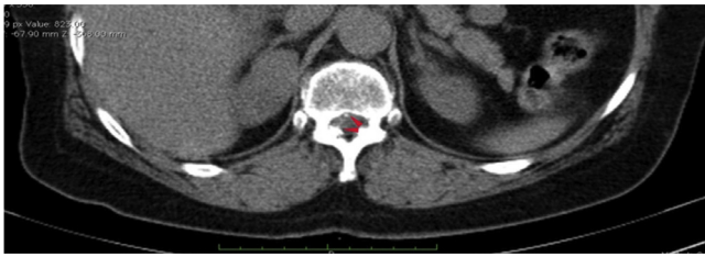
Figure 2 Anterior and posterior epidural venous plexus with contrast.