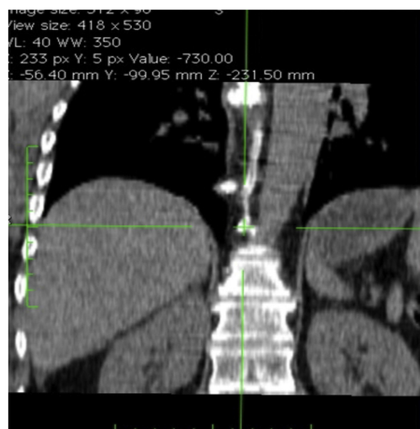
Figure 6 Azygos vein in the coronal plane.