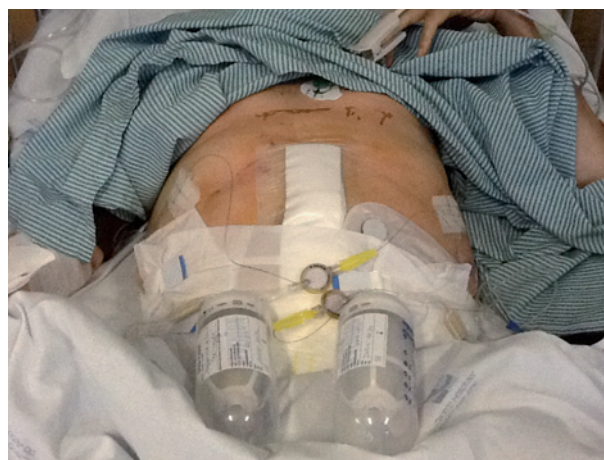
Figure 5 Elastomers bilaterally connected to TAP catheters.