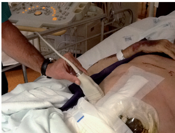
Figure 1 Tube position during TAP approach.