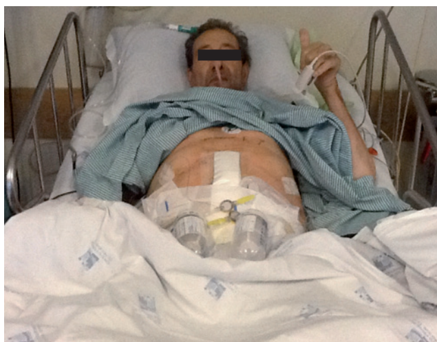
Figure 4 Patient monitoring at 48 hours.