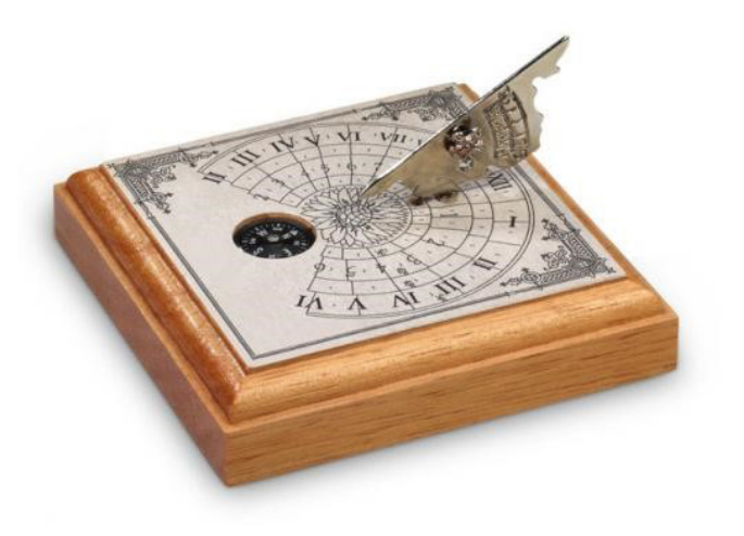
Figure 2. "Santa Cruz" Sundial.

According to the analysis, it was possible to identify improvement possibilities in two aspects of the product, namely: consumer expectations and use of resources in cascade. With regard to consumer expectations, the product has potential for upgrades, since the fragility of the material (gnomon) causes the product to deteriorate quickly, which is against its proposed durability. However, the company has realized this demand and is currently