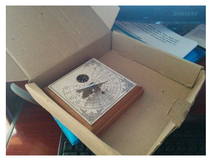
Figure 3. The product package.

The sundial packaging (Figure 3) consists of a cardboard box of 20 \times 17.5 \times 4.5 cm. It is oversized for the product and does not protect it from any shocks or weights placed on the package. Research has identified that the parts that require protective packaging are on the top of the sundial (paper and gnomom). An improvement possibility is making a sort of lid covering only the top of the object, made of a similar wood from the basis. Another possibility raised was to shrink the package and to use a thicker cardboard, which protects the gnomom. Although the likelihood of the cardboard still be dispensed is high, this suggestion