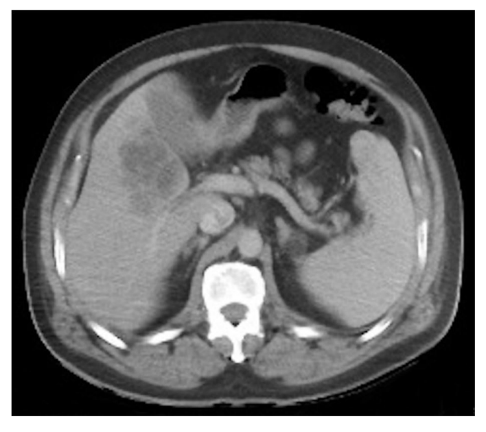
Figure 1. Abdominal computed tomography scan with intravenous contrast, portal phase, showing a hypodense and septated lesion in the hepatic segment V with peripheral enhancement.

On day 6, a control CT scan showed an increase in the lesion volume (264 ml). Due to the unavailability to perform percutaneous drainage, the laparoscopic approach was performed. The procedure disclosed a thickened gallbladder wall, adhesions, and a hepatic bulging close to the gallbladder bed. After the release of adhesions, the abscess was drained – a thin and elongated foreign body of approximately 4.1 cm, resembling a rosemary twig (Figure 2), was found and removed from inside the liver abscess cavity (liver segment V). The abscess content was sent for culture. Despite not showing up complicated acute cholecystitis, because there was a cleavage plan between the gallbladder and the abscess, cholecystectomy was