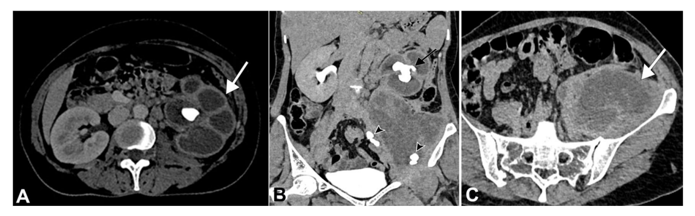
Figure 3. Abdominal CECT axial and coronal section shows XGP of the left kidney. A – Corticomedullary phase of CECT shows an enlarged left kidney with gross hydroureteronephrosis with thinning of renal cortex and a staghorn calculus within the renal pelvis, which is contracted, whereas calyces are dilated giving the appearance of a "Paw of A Bear" (white arrow); B – Excretory phase of CECT shows a staghorn calculus measuring 3.8 \times 2.4 cm (black arrow) within the renal pelvis. Multiple calculi, the largest measuring 1.6 \times 1.4 cm (arrowheads), were noted in the ureter and the collection; C – Large collection within the left iliopsoas muscle consistent with left psoas abscess (white arrow).