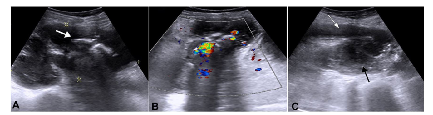
Figure 2. Abdominal USG showing a calculus and left psoas abscess. A and B – A large calculus probably a staghorn calculus (white arrow) with a twinkling artifact and posterior acoustic shadowing; C – Dilated proximal left ureter (white arrow) in close contact with a large collection in the left psoas region (black arrow).

Microscopically, the kidney sections showed hyalinized glomeruli and atrophic tubules lined by flattened cells, and the surrounding blood vessels