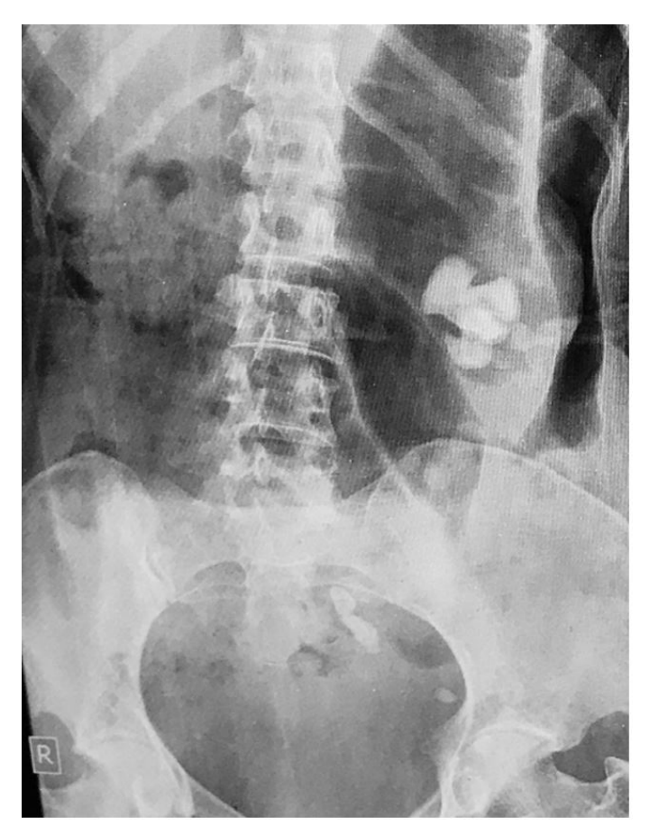
Figure 1. Abdominal plain radiograph shows a large radio-opaque shadow in the left renal fossa and multiple small radio-opaque shadows in the left pelvic region. These findings are consistent with multiple calculi.

The abdominal ultrasound (USG) showed a large calculus, probably a staghorn calculus measuring