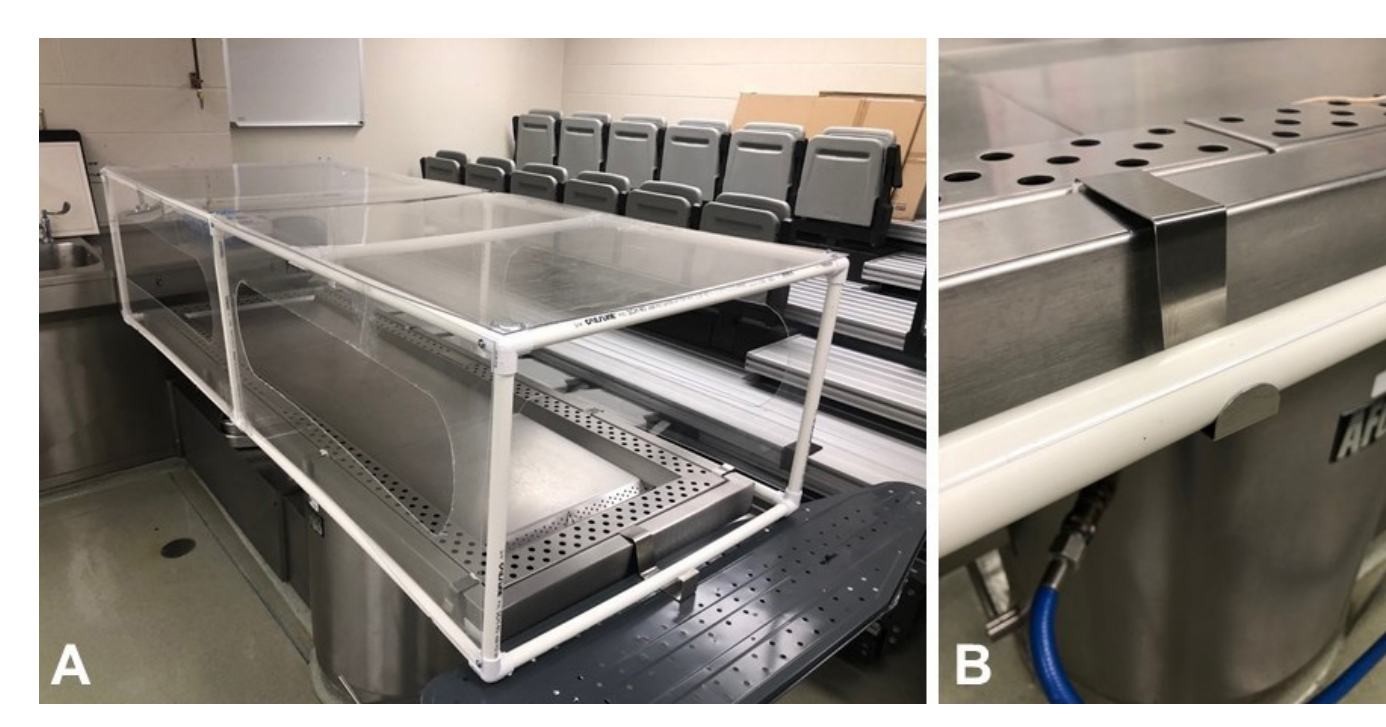
Figure 1. R.A.G.E. cage full set up with ironing board support (A) and close up of suspension with door hooks (B).