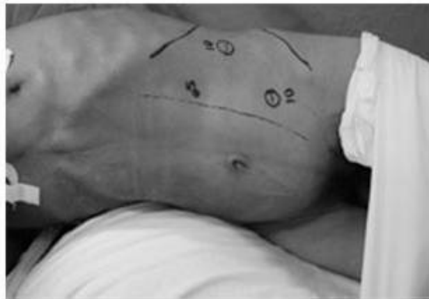
Figure 2 - Marking of portals for retroperitoneal cavity access (an alternative, as described in the text, is to introduce a fourth portal for the retractor)

Creation of a space in the retroperitoneal cavity, by inflating the gas, and with the aid of a camera that provides direct and safer visualization, allows introduction of the second and third portals. The second 10-mm portal is placed around 2-4 cm laterally to the rectus abdominis sheath, distally to the camera portal. The third portal, measuring 5 mm, is placed in the same reference as the second, but in proximal position. These two latter portals are used as work instruments (dissection and grasping). A fourth portal is often needed to place a third work instrument (liver retractor), which will retract the psoas muscle superiorly, since it frequently covers the sympathetic chain, making visualization difficult.