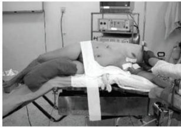
Figure 1 - Patient positioning at surgical table

introduce the trocar. The site of those incisions is represented in Figure 2. The first 2-3 cm incision is located in the anterior axillary line, half way through the coastal ridge and the iliac crest, by which a 10-mm camera was introduced. Through this first entry, a blunt dissection was initially performed, progressing through the aponeurotic muscle until reaching the peritoneum. At that moment, a finger dissection was performed, reflecting the peritoneum medially until reaching the retroperitoneal fat; next, the 10-mm trocar is inserted to create space, reflecting the peritoneum medially. Then, both incision extremities were sutured at the fascia to avoid leakage of carbon gas, which will be insufflated with 12-14 mmHg pressure.