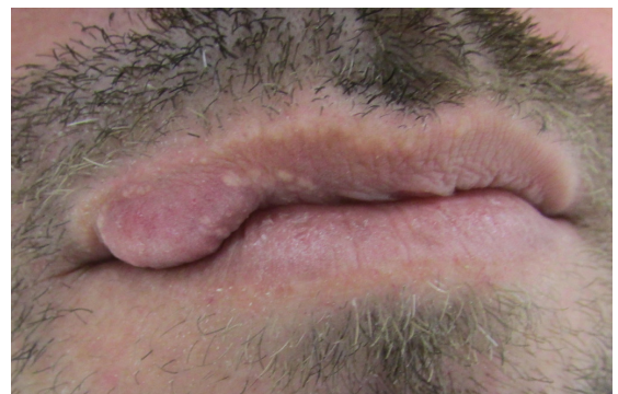
Figure 1. Clinical appearance: nodular lesion on upper lip.